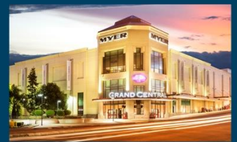
Grand Central, Toowoomba