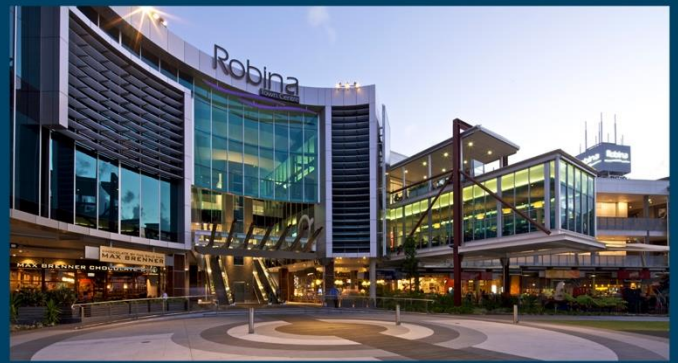
Robina Town Centre, Gold Coast

Over the past couple of years most of these shopping centres have gone through expansions and our investment in these shopping centres has helped create jobs for workers in the building and construction industries.